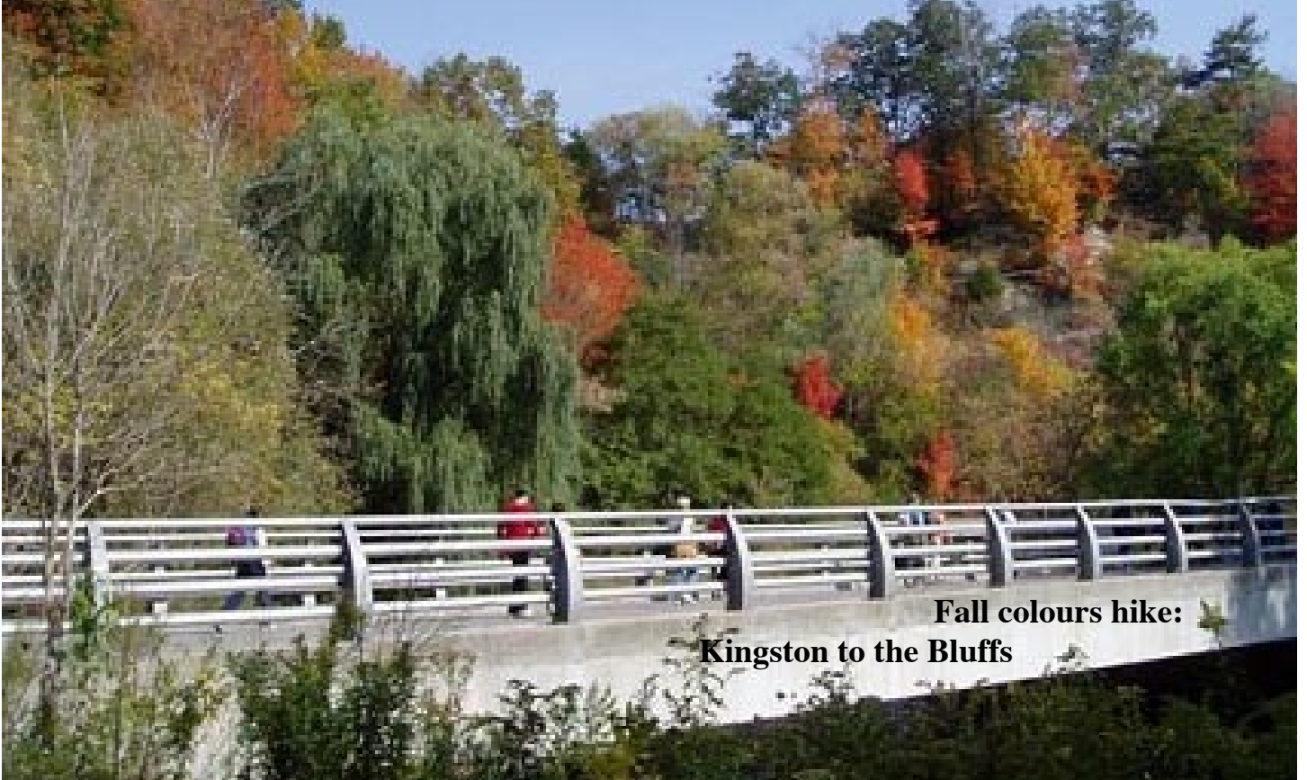
Fall colours hike: Kingston to the Bluffs