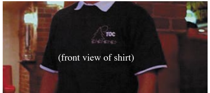
(front view of shirt)