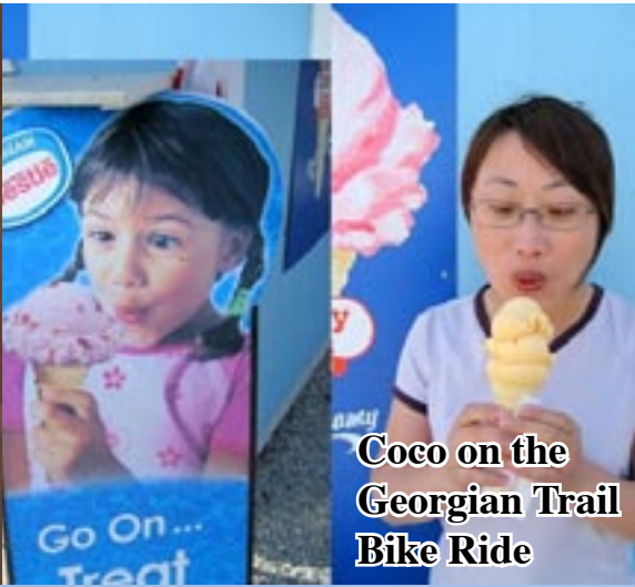
Coco on the Georgian Trail Bike Ride