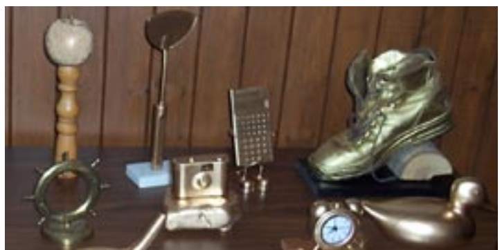
The Golden Boot award, among others. (AGM 2006)