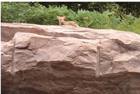
A red fox kept a wary eye on us

Suggestions, recipes (for camping & back country trips), articles or anything else you feel is suitable would be welcome. Obviously we can't guarantee everything we see will be published, but we'll try. Due to potential copyright issues, only photos taken by the editor can be published in the Newsletter.