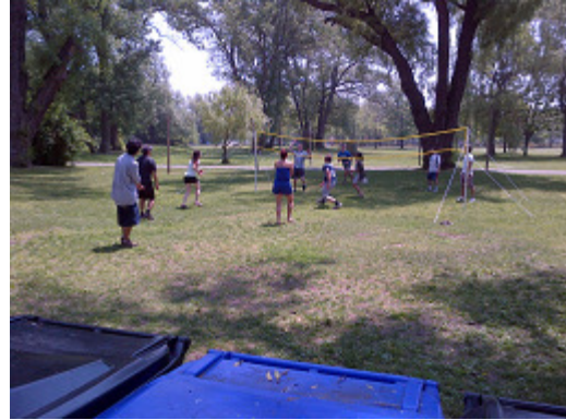
As we played

We post event photos and other items of interest to our members.