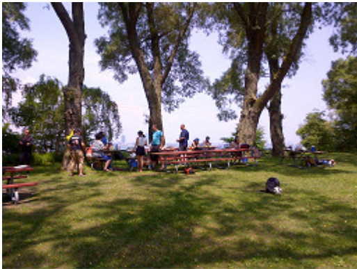
As we gathered

Dining and socializing were the primary activities, but there was some physical play as well thanks to members bringing Frisbees, a Volleyball set and a homemade Beanbag toss kit.