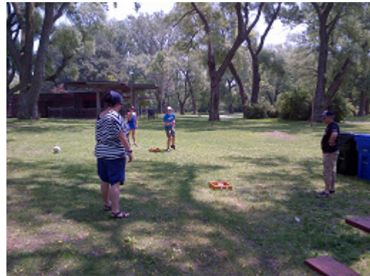
As we tossed