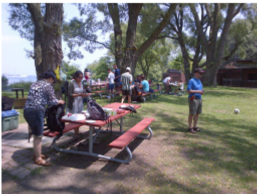
As we ate